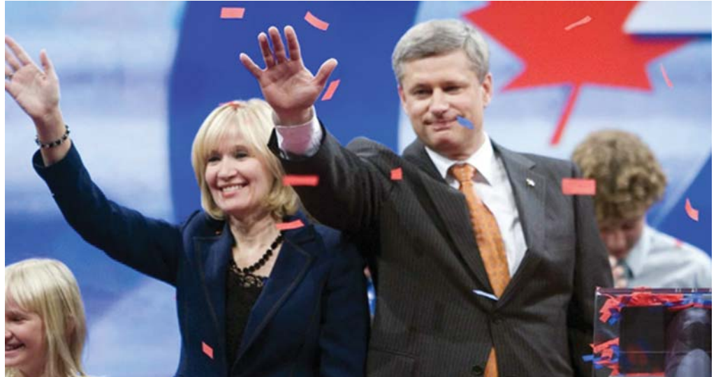
On Oct. 14, 2008, Canadians chose a Conservative government led by Prime Minister Stephen Harper