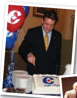
Paul Calandra, MP celebrates our 5th anniversary